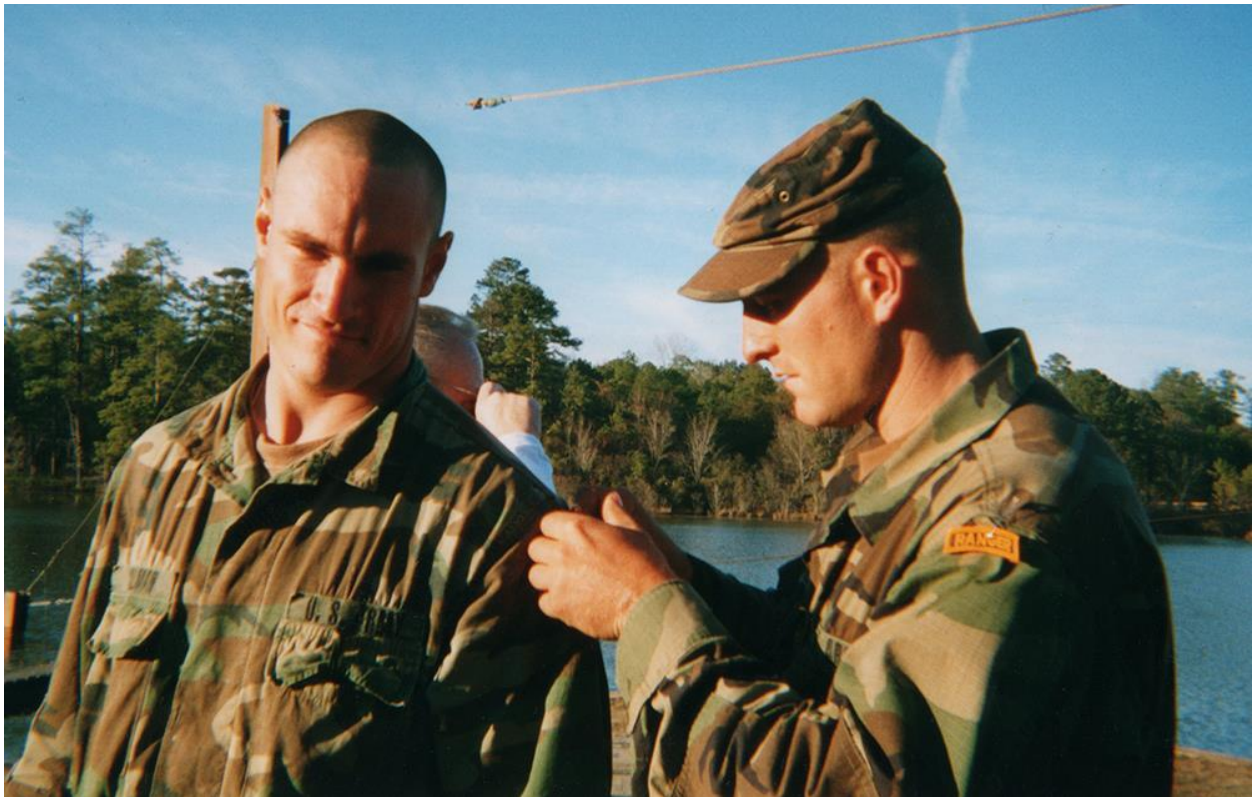
The day after the attacks of September 11, 2001, Pat told a reporter, “At times like this you stop and think about just how good we have it, what kind of system we live in, and the